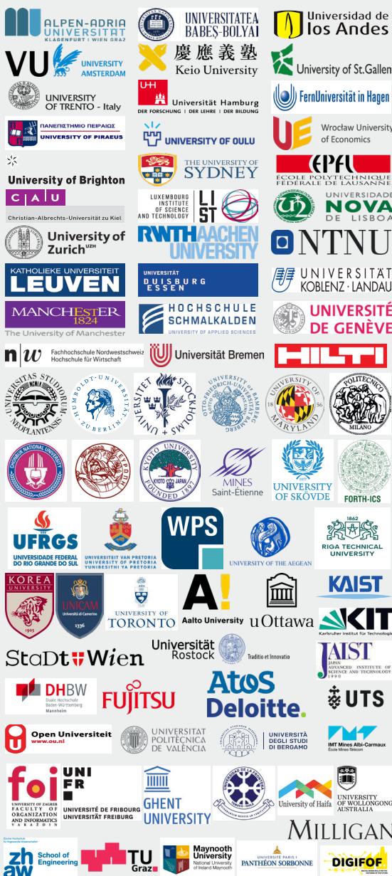
A selection from previous editions.